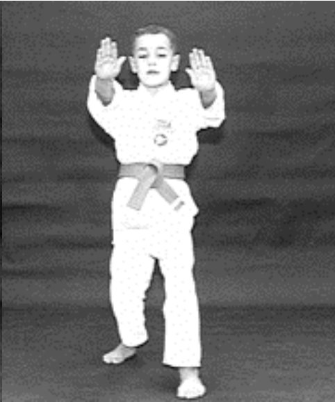
Crossing the back foot and turn forward rising up. Push both hands forward and KIAI (shout)!