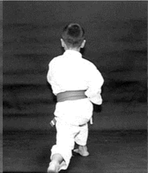
Cross the back foot behind and without rising pivot on both feet and punch with the left arm.