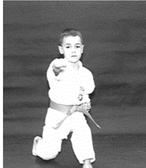
Without rising, move the back foot to the forward position and pivot punching with the right arm.